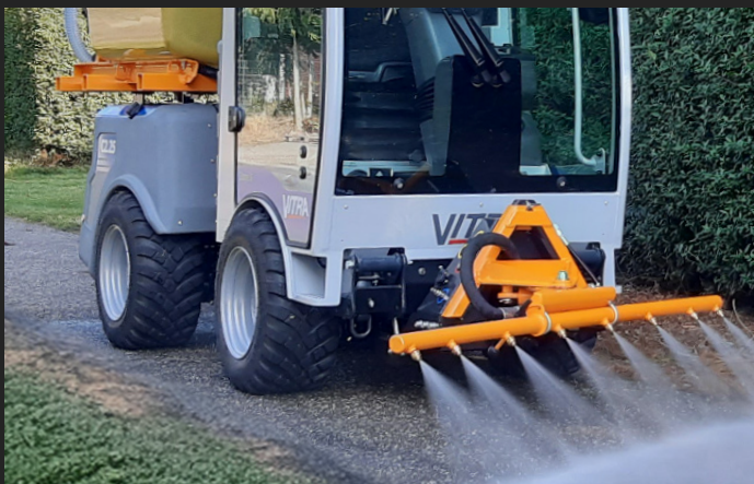
The wide selection of attachments also includes a washing system with a flush boom and the option of a high-pressure cleaner