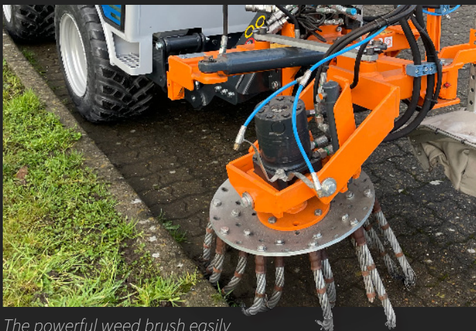
The powerful weed brush easily removes even the most stubborn weeds