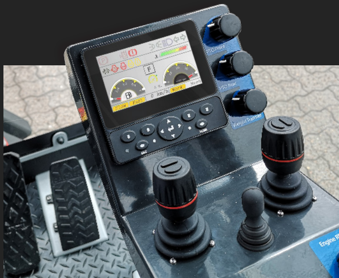
The C3 Series is easily maneuvered with the 2 proportional joysticks, which ensure that the intuitive operation can be performed precisely

The C3 Series is equipped with a new proportional maneuver and PTO system, which ensures optimal flow control for a given tool. The system is easily controlled via the built-in screen mounted in the armrest and optimizes the operation.