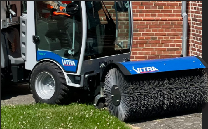
The center-driven sweeping broom is designed to fit the Vitra's power and maneuverability as best as possible

In addition to Vitra's well-known sweeping suction systems, there is also a wide range of attachments for external cleaning for the C-series, which span, among other things Vitra's self-developed center driven and center swinging broom, leaf vacuum front and a wide range of environmentally friendly and effective weed control tools, with either hot air, hot water or a mechanical weed brush