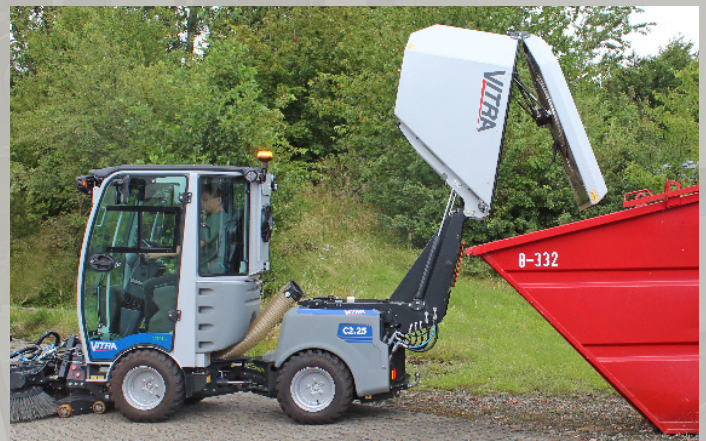
The container is emptied from the cabin and with a unload height of 175 cm. emptying can take place directly in a container or trailer