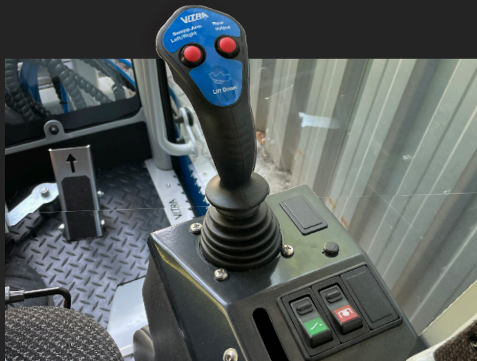
The C2 series is also built with functional and easy operation which ensures efficient and precise operation, regardless of task

" Only need one machine for all the tasks of the year "