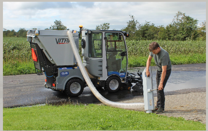
With the external suction hose, there is the possibility of efficient cleaning where it is not possible to drive the machine

Of course, the new series of Sweeping-Suction systems also meet all applicable requirements for EUUnited PM2.5/10 certification.