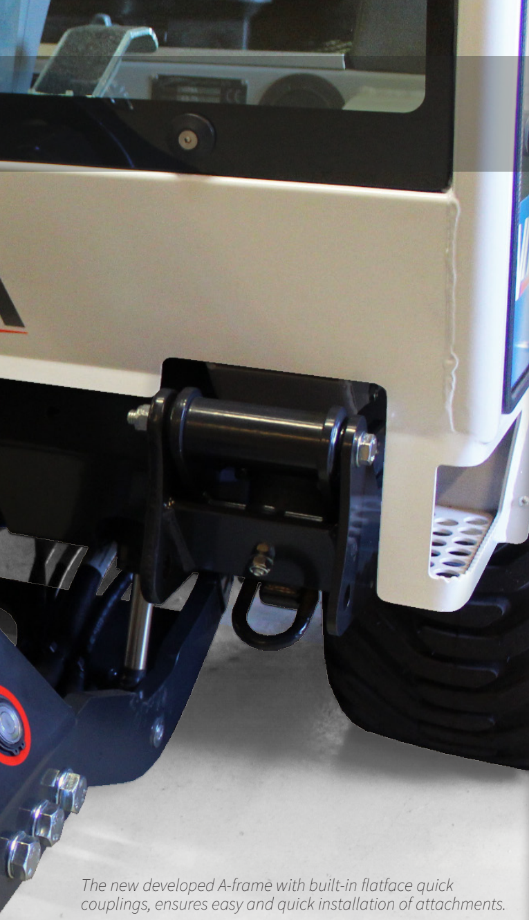
The new developed A-frame with built-in flatface quick couplings, ensures easy and quick installation of attachments.