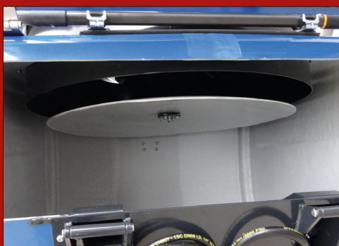
Vitra's suction unit uses a unique cyclone filter system which effectively cleans the air for particle dust.