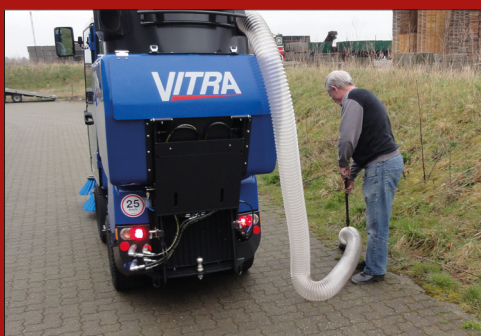
The suction unit is by default equipped with a 5 meter handheld suction hose which ensures great flexibility.