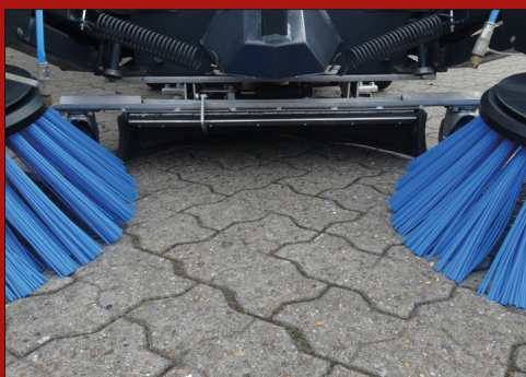
The wide suction head is equipped with a hydraulic flap which ensures easy collection of larger pieces of waste.