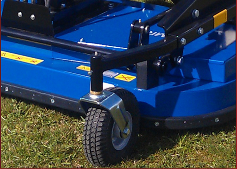
The mower is installed with strong rubber-upport wheels in the front and back to ensure optimal stability.