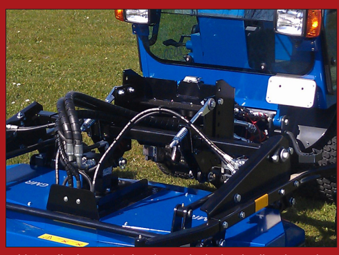
Additionally the cutting height can be hydraulically adjusted, which can easily be done by the driver directly from the cabin