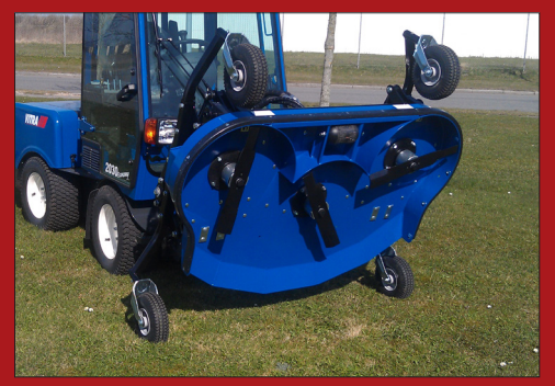
The mower can be tilted upwards, to ensure easy cleaning and