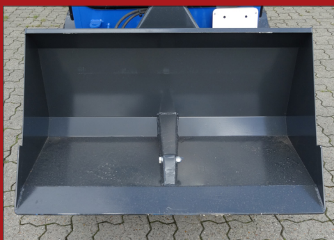
The shovel makes it possible to work directly next to edges, so the full width can be exploited.