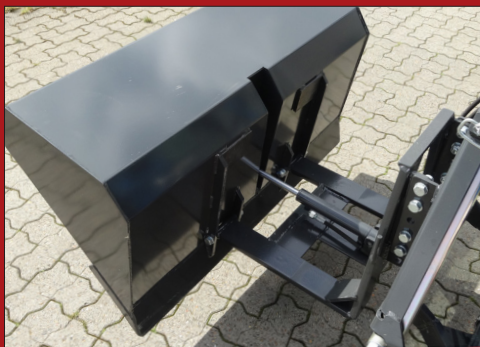
The robust but compact build ensures a large payload and low weight.